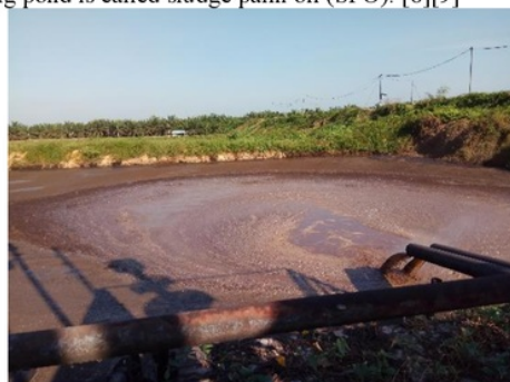
Figure 1. POME in the Cooling Pond

POME can release methane gas into the atmosphere due to the degradation of organic compounds. Methane is one of six greenhouse gases set by the Kyoto Protocol. Besides releasing methane gas, POME from palm oil waste has a very high content of COD (Chemical Oxygen Demand), around 60,000-90,000. Even though it releases a methane gas and has a high COD content, POME has the potential as an alternative energy for biogas power plants. Figure 1 shows the POME collected in cooling pond. The water used for extraction process discharged into sludge pit and cooling pond, which known as POME. Small amount of oil leaked from various stage into this pond. The oil is separated and accumulated. It creates a thick surface on top of the cooling pond. Oil that recovered from cooling pond is called sludge palm oil (SPO). [8][9]