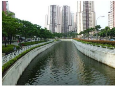
Fig. 1. The Epicentrum River.

For that, we try to adopt more sensitive fish that is Koi fish ( Cyprinus Carpio ). Koi fish is known as a fish that is sensitive and requires water with excellent quality for the place of its life (Twigg, 2013).