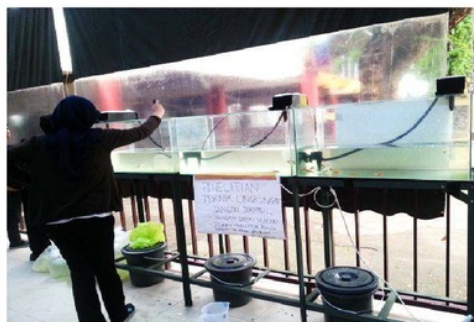
Fig. 4. First stage of experiment.