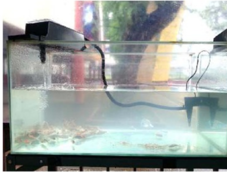
Fig. 2. Koi fish acclimatization process.

Three aquariums each containing 16 Koi fish were given different treatments, namely aquarium control, an aquarium with maximum intervention and aquarium with minimal intervention. Figure 3 shows the preparation of aquarium I, II and III. Figure 4 shows the aquarium I, II and III with Koi fish and Figure 5 shows a graph of Epicentrum river water concentrations and the number of survive fish.